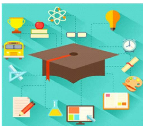
Figure 9: Smart Education System. Adapted from Google

In future it won't be surprise us if students interact with blackboard directly in classrooms to solve their queries. Exams will be done in different manner or interactive blackboard will automatically judge student based on their talents. Students do not have to wait till next morning for school to get answer to their queries. Student will be able of interact blackboard on the go for anywhere in the world to solve their queries.