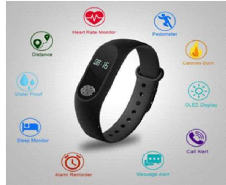
Figure 2: Fitness Band. Adapted from Google

based system. This device used for monitoring and tracking fitness related metrics such as distance walked or run, calorie consumption, and in some cases heartbeat and quality of sleep. It is a type of wearable computer.