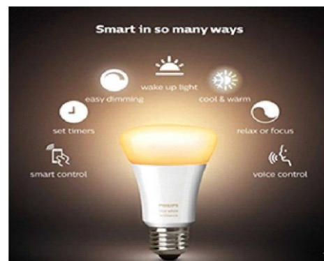
Figure 3: Smart Bulbs. Adapted from Google

Smart Bulbs can operate remotely via smart phone or remote. It is very convenient and easy to operate to make light on/off also for dimming. It has adjustable light intensity to set ambiance and many more features. Authors (Dikel et al., 2019) Evaluated the standby power consumption of smart LED bulbs by taking 3 samples from 30 models.