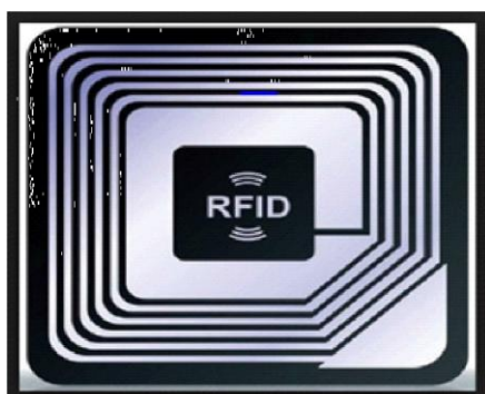
Figure 5: RFID. Adapted from Google

Authors (Yunsheng et al., 2009) discussed their views Towards Developing an Edible Fungi Factory HACCP MIS Based on RFID Technology. The NutriSmart concept for a food tracking system uses RFID tags embedded in food along with a special plate that scans everything you eat to track nutrition and food allergies as well as provide a little extra information.