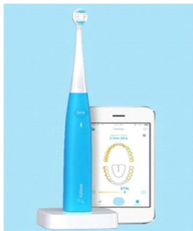
Figure 4: Smart Toothbrush.

Authors (Stark & Samarah, 2019) proposed a solution for improving the oral hygiene and preventing cavities by enabling concise feedback in real time based on the teeth and surfaces brushed.