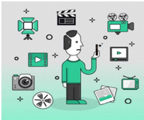
Figure 12: SmartEntertainment application.

Now, just as ways of entertainment is growing, Development is also on the rise. Entertainment is very important to live life healthy. One can take a challenge to develop an application which will not only notify user about their favorite shows but it will book the show according to his interest and schedule.