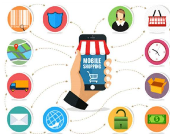
Figure 11: Smart Shopping application. Adapted from Google

Nowadays many smart apps are available for shopping and selling purpose. But still there is a scope for more growth. One can develop an application which can track all groceries or needed things in house. Before it goes out of stock, application will search on internet for availability of those things in nearby markets while comparing price among themselves and then notify that user.