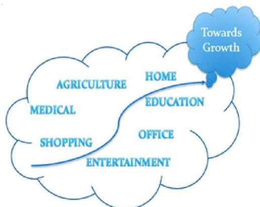
Figure 13: Conclusion

Small missing things like key, certificates, books etc. will be just one click away from you. All small devices will have tag on it. Once the application gets in range, that thing will give beep. If that thing lost somewhere else then that application will guide about that location.