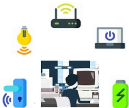
Figure 8: Smart appliances in office

For example, if you reach to office at 10.00 o'clock, then all the appliances automatically turn on at 09.58 o'clock. If you stuck in traffic or have some outdoor duty, then according to your location and schedule respectively all appliances remain off.