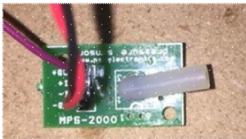
Figure 3: MPS2000

-40 to +85°C, solid state reliability, ease of use, non-corrosive with most of gases and dry air.