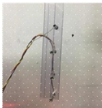
Figure 2: Level Sensor

The level sensor is defined as a transducer which uses a low voltage, usually by a source of power supply. We are considering 4 leads; one acts as ground lead and the rest are the reference leads. When the fuel comes in contact with the ground lead and one of the reference leads, conductivity starts and the internal circuit completes. This sensed information is sent to Arduino and the output is displayed through LCD and voice output only if the fuel level falls below the ground lead indicating 'low fuel' using APR33A3 voice recording module.