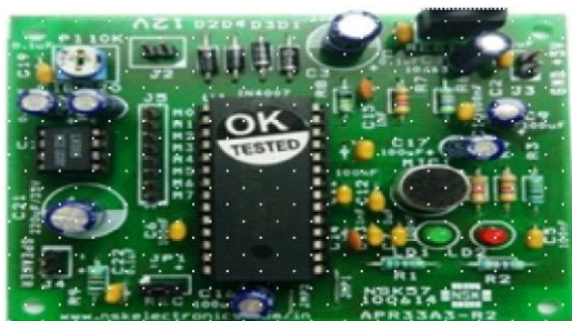
Figure 4: APR33A3 module

To record a voice message in the IC, a low signal is applied to the record pin from one of the channels of the IC from Arduino. A timer can be set for the amount of duration required, to keep the pin low. After recording, the record pin has to be made high and this stores the message in that pin. To playback the voice, apply low signal to that pin of channel which holds the message.