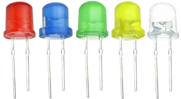
Figure 2: LED