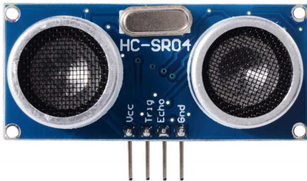
Figure 3: Ultrasonic Sensor