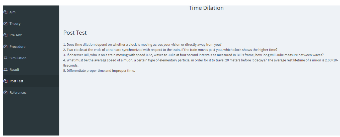
Figure 8: Sample questions in post-test