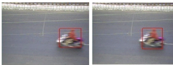
Figure 3: Speed Measurement of Vehicle from the "Traffic 1" Sequence (a) Frame Number 655 (b) Frame Number 656