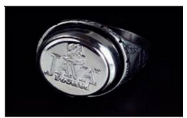
Figure 5: JAVA Ring