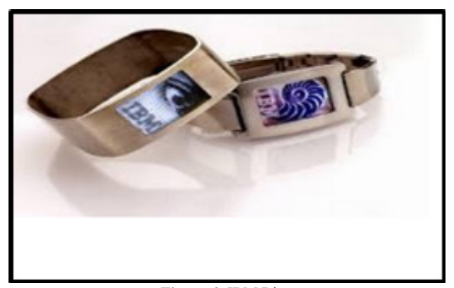
Figure 6: IBM Ring

We are bit by bit moving to the fifth era electronics which are convenient and tiny to be a piece of individuals' dress. Anyway these little processing gadgets offer restricted cooperation capacities contrasted with PCs or a telephone." By the finish of this Decade, we would be wearing our PCs as opposed to sitting before them."