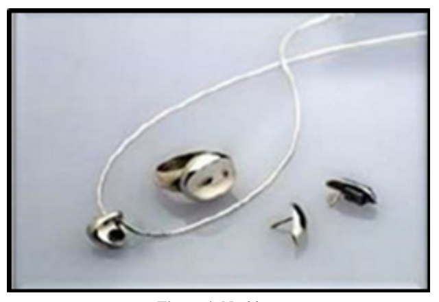
Figure 4: Necklace

Java ring is a sort of sharp truck that is wearable on the finger. Java ring is a solidified steel ring with 16 millimeters in expansiveness. Java ring is a protected Java controlled electric token.[4]