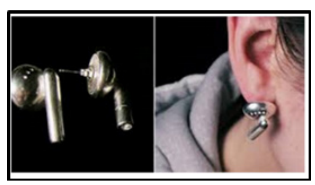
Figure 3: Hoops