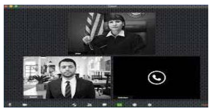
Figure 2: E-court hearing during pandemic<sup>[14]</sup>

great potency to make the judiciary system of India smarter, hopefully the smartest. The robotic controlled library would automate data entries to official registers, filling procedural documents, and exchanging case-related information. Also, a necessary check is needed to protect judicial data from hackers. Another result of an embedded system based robotic controlled library could be the automatic drafting of summons. This process can shift the agencies performing task from human clerks to non-living machines and systems. [20]